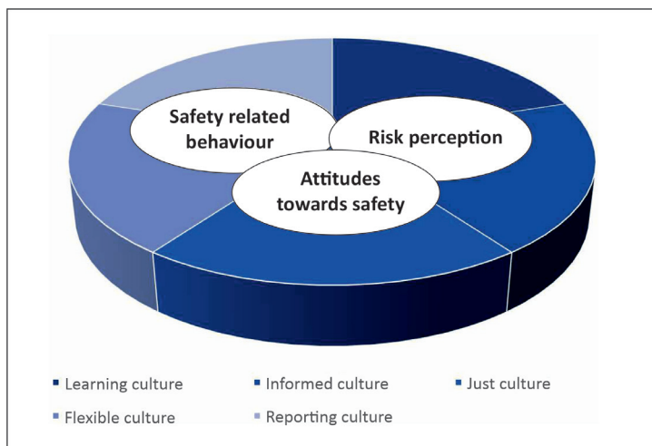
Figure no. 2: Elements of a safety culture (CANSO, lb.)