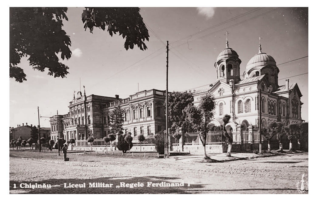
"King Ferdinand I" Military High School

At the inauguration of the Military High School in Chişinău, on 16 November 1919, have participated Generals Lupescu and Ghinescu, Archbishop Nicodim, the minister of Bessarabia and the authorities of the city of Chişinău (Agency, F. 1862, inv. 3, f. 3, p. 105).