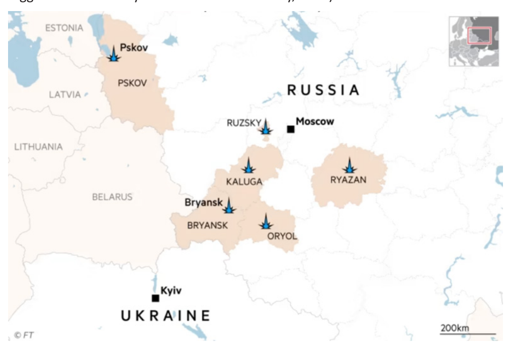
Figure no. 2: Ukraine drone strike destroys Russian military aircraft (Ukraine launches biggest drone attack yet inside Russian territory, 2023)

The conflict generated by Russia gained momentum starting on 24 February 2022, through the invasion of Ukrainian territory. As Ukraine considers the Crimean Peninsula part of its national territory, the strategic interest attached to this area is implicitly major. Recently, Ukraine carried out the largest drone attack to date against Russian infrastructure in the Black Sea and Crimea regions (Ukraine launches biggest drone attack yet inside Russian territory, 2023).